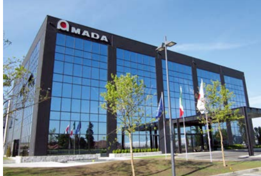
Technical Centre in Italy