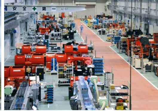
Headquarters in Japan (Isehara)